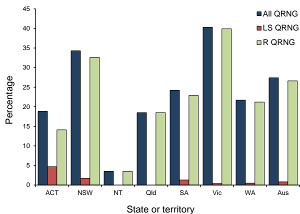
Figure 2: Percentage of gonococcal isolates less sensitive to ciprofloxacin or with higher level ciprofloxacin resistance and all strains with altered quinolone susceptibility, Australia, 2011, by state or territory