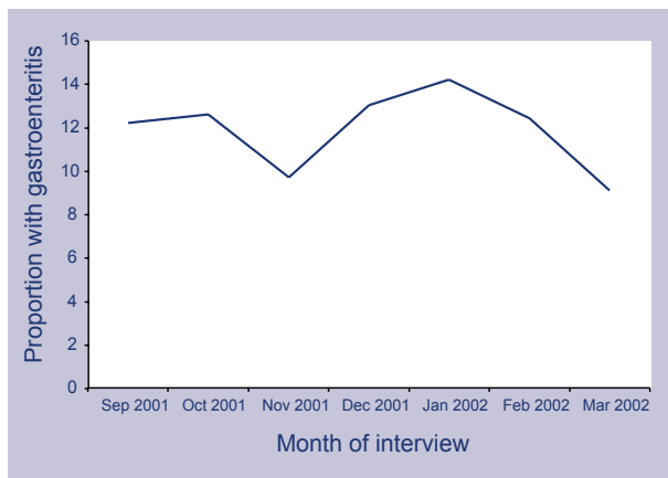
Figure 2. Unweighted results of the national OzFoodNet gastroenteritis survey showing the proportion of respondents reporting an episode of gastroenteritis in the previous month (n = 3,916), September 2001 to March 2002

The data collected in this survey will contribute to OzFoodNet's calculation of an estimate of the proportion of gastroenteritis due to food. During the quarter, OzFoodNet held discussions with international programs researching gastrointestinal disease and agreed to compare survey date and findings.