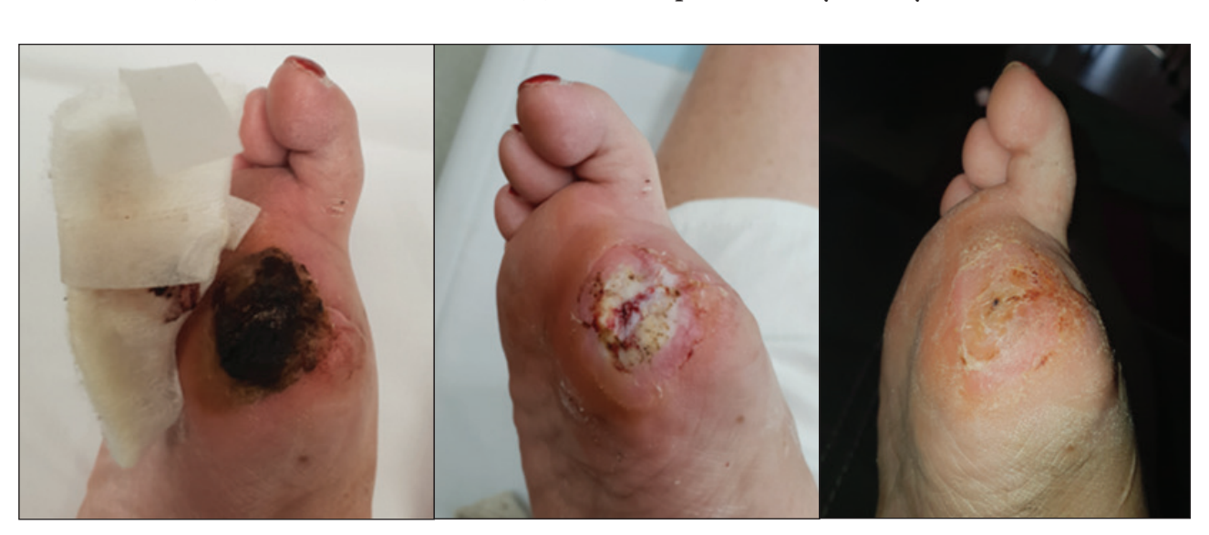
Figure 2: Wound from previous right great toe amputation of Case Three: (A) before debridement, (B) after debridement, and (C) after completion of erythromycin treatment

A 22-year-old female presented to her local GP in September 2020 after a burn injury at home. The initial injury was described as light pink covering the dorsal surface of the right foot. Five days later there was change in colour and increase in slough, with infection confirmed by a wound swab revealing heavy growth of Staphylococcus aureus and Corynebacterium ulcerans , with moderate growth of Streptococcus sp. The C. ulcerans isolate was toxin gene positive and notified to MNPHU. Interview revealed no history of overseas travel, and no contact with raw animal products or animals other than a household dog. The case reported no direct wound contact with the dog and kept the wound covered other than for showers, although dog hair was reported to be common in the environment. One household contact was identified, who was well and was up to date with vaccinations. Antibiotics were organised for both case and household contact and the case was provided with a booster DTCV. Infectious Disease specialist advice was sought due to penicillin resistance of the C. ulcerans isolate, resulting in switching from flucloxacillin to doxycycline for treatment. The wound completely healed within days of commencing doxycycline. Nose and throat swabs of the case and contact did not have Corvnebacterium isolated.