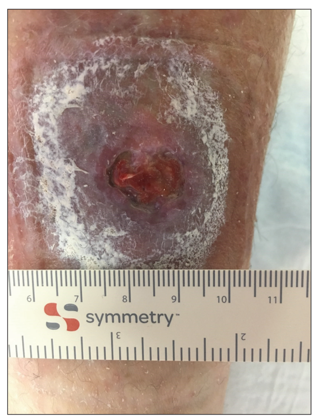
Figure 1: Left lower leg ulcer of Case Two, four weeks after initial swab collection which was positive for toxigenic C. ulcerans and two weeks after completing 14 days of erythromycin treatment

The case lived with two dogs, whose mouth swabs tested positive for toxin gene-bearing C. ulcerans which matched the owner's sample on genome sequencing prior to treatment with erythromycin. Post-treatment swabs from the dogs were negative. Infection control advice was provided to the short-term kennel facility attended by one of the dogs.