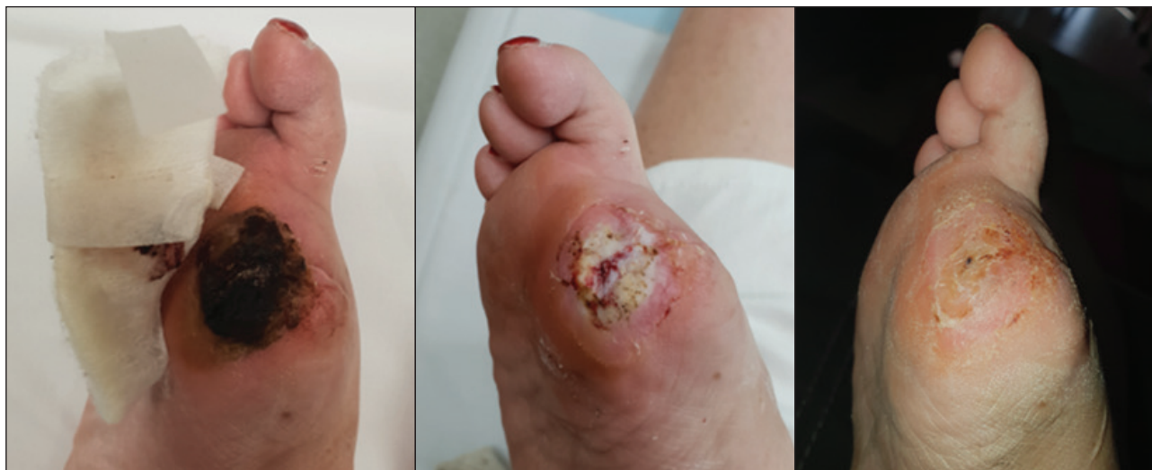
Figure 2: Wound from previous right great toe amputation of Case Three: (A) before debridement, (B) after debridement, and (C) after completion of erythromycin treatment

A 22-year-old female presented to her local GP in September 2020 after a burn injury at home. The initial injury was described as light pink covering the dorsal surface of the right foot. Five days later there was change in colour and increase in slough, with infection confirmed by a wound swab revealing heavy growth of Staphylococcus aureus and Corynebacterium ulcerans , with moderate growth of Streptococcus sp. The C. ulcerans isolate was toxin gene positive and notified to MNPHU. Interview revealed no history of overseas travel, and no contact with raw animal products or animals other than a household dog. The case reported no direct wound contact with the dog and kept the wound covered other than for showers, although dog hair was reported to be common in the environment. One household contact was identified, who was well and was up to date with vaccinations. Antibiotics were organised for both case and household contact and the case was provided with a booster DTCV. Infectious Disease specialist advice was sought due to penicillin resistance of the C. ulcerans isolate, resulting in switching from flucloxacillin to doxycycline for treatment. The wound completely healed within days of commencing doxycycline. Nose and throat swabs of the case and contact did not have Corynebacterium isolated.