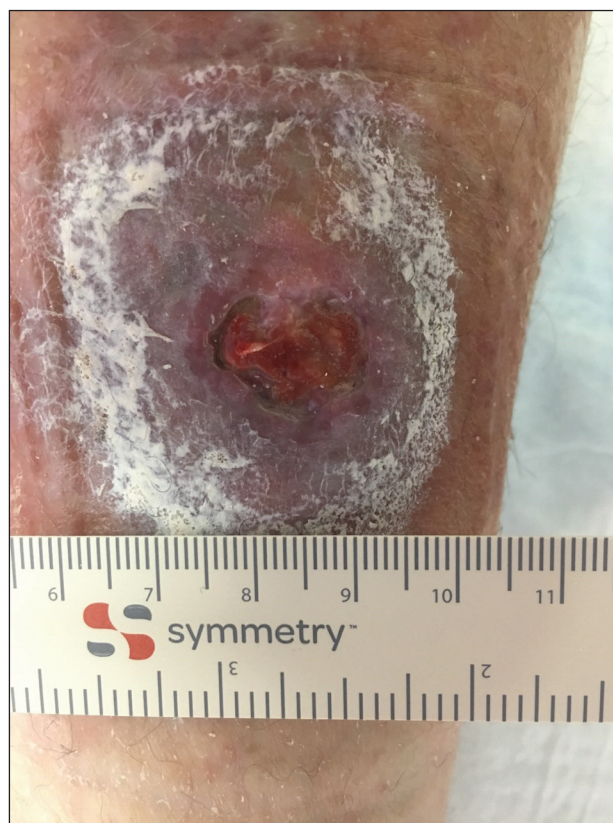
Figure 1: Left lower leg ulcer of Case Two, four weeks after initial swab collection which was positive for toxigenic C. ulcerans and two weeks after completing 14 days of erythromycin treatment

The case lived with two dogs, whose mouth swabs tested positive for toxin gene-bearing C. ulcerans which matched the owner's sample on genome sequencing prior to treatment with erythromycin. Post-treatment swabs from the dogs were negative. Infection control advice was provided to the short-term kennel facility attended by one of the dogs.